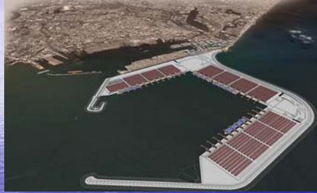
Colombo South Harbour